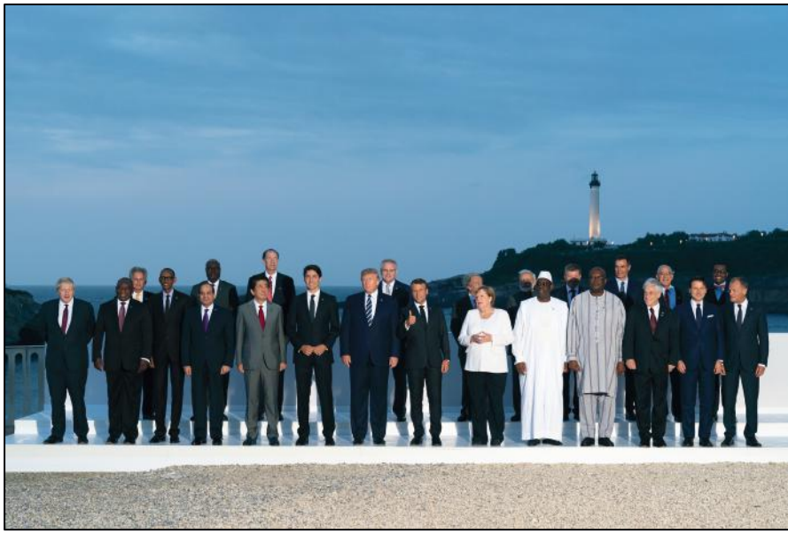
Leaders and extended members of the G7 (above) at the Hotel du Palais Biarritz in Biarritz, France for this year’s summit.

Lebanese President Michel Aoun proclaimed that an Israeli drone attack on Beirut last weekend was a “declaration of war” while Prime Minister Saad Hariri called it a “blatant violation” of Lebanese sovereignty. Israel further struck in Iraq, prompting Iraqi President Barham Salih to condemn the drone attacks as a “hostile act that targets Iraq”. In a third instance on Monday, Israeli drones attacked a Palestinian base in eastern Lebanon near the border with Syria, in a likely message to Hezbollah.