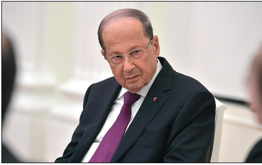
Lebanese President Michel Aoun (above) proclaimed an Israeli drone attack on Beirut as a “declaration of war” that justified a “right to defend [the country’s] sovereignty, independence and territorial integrity”.