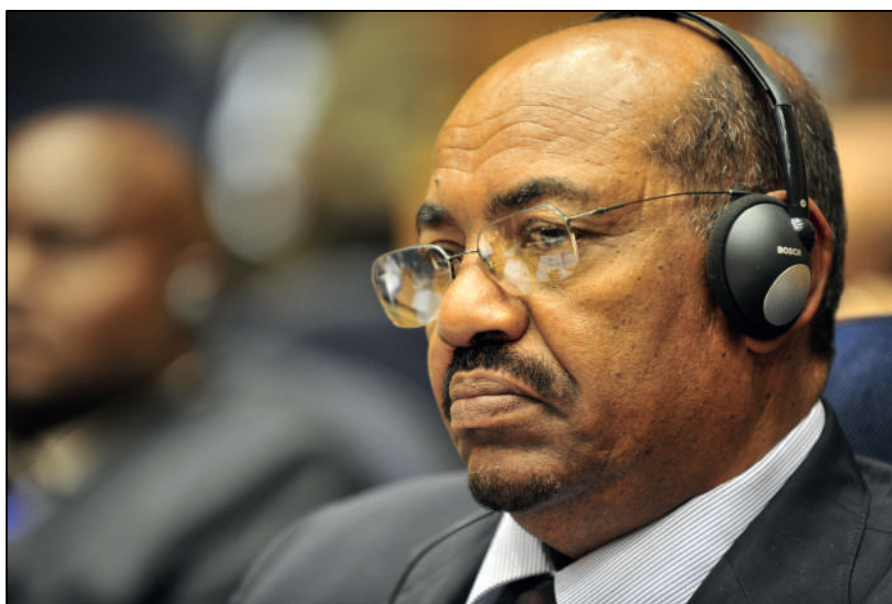
Deposed Sudanese President Omar Hassan al-Bashir's (above) corruption trial began on Monday. His 30-year rule saw the secession of South Sudan in 2011 and the eruption of the Darfur crisis in 2003.