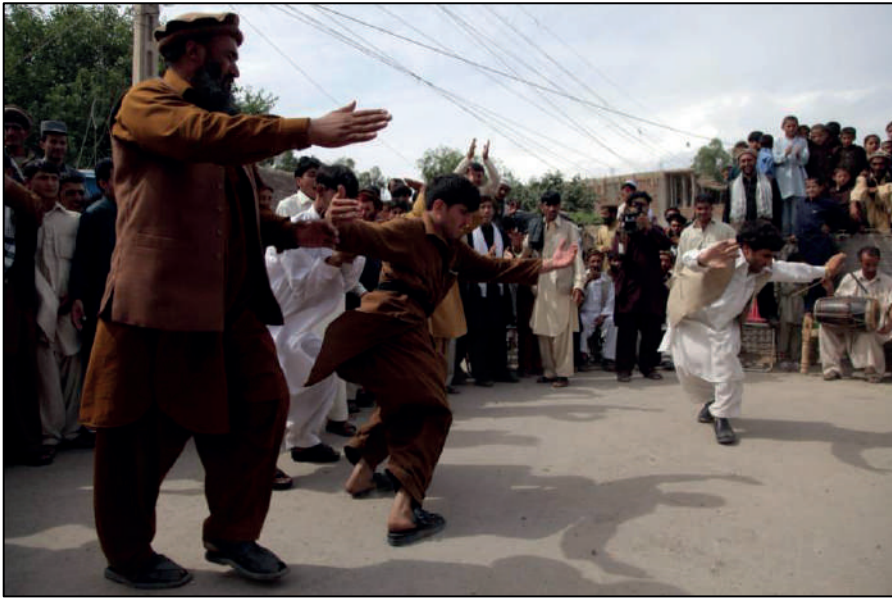
Participants (above) dancing at an Afghan wedding in Nangarhar, Afghanistan.

Sudan's deposed leader Mr Omar Hassan al-Bashir revealed that he had received US$90 million from Saudi Arabia during his trial on corruption charges. While in power, Mr al-Bashir sent thousands of troops to support the Saudi-led war campaign in Yemen in return for Saudi Arabia and the United Arab Emirates' backing. These countries have, however, quickly switched sides after Mr al-Bashir was ousted to instead support the military junta that toppled him. This marked a dramatic start to a trial that is set to bring about momentous change in Sudan.