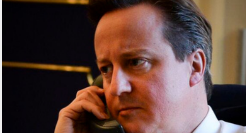
Last week, Mr Cameron (in picture) announced that those responsible for settler violence against Palestinians would be banned from entering Britain following a similar plan by the EU.

On his second visit to the region, British Foreign Minister David Cameron will travel to Amman and Cairo this week to push for a sustainable cease-fire and further humanitarian pauses in Gaza, sources said on Wednesday.