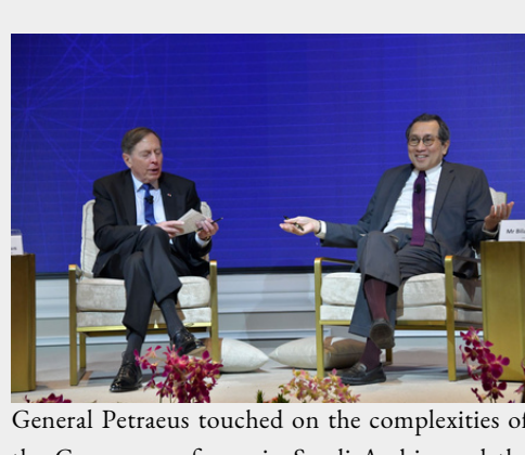
General Petraeus touched on the complexities of the Gaza war, reforms in Saudi Arabia, and the development of the UAE, among other topics.