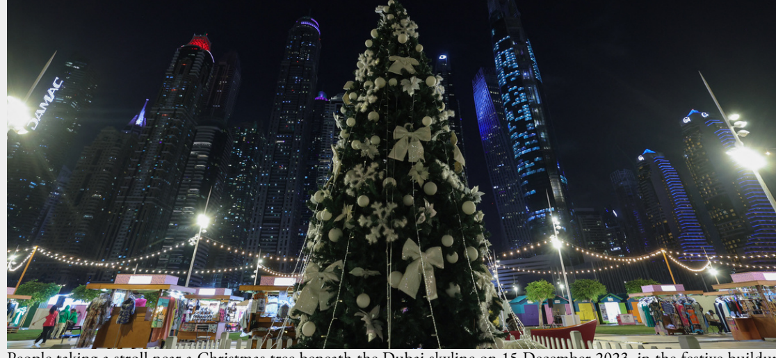
People taking a stroll near a Christmas tree beneath the Dubai skyline on 15 December 2023, in the festive buildup to the holiday season.