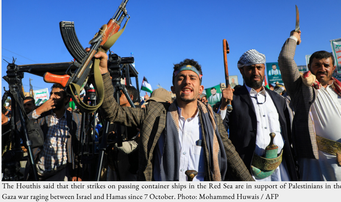
The Houthis said that their strikes on passing container ships in the Red Sea are in support of Palestinians in the Gaza war raging between Israel and Hamas since 7 October.

No regional country, except for Manama, has joined the US' naval task force against the Houthis in the Red Sea. Arab nations are seemingly hesitant to align with the US in a military venture due to its support for Israel's war in Gaza, despite relying heavily on the trade route.